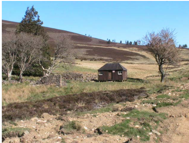
Fig. 3: Photo taken from existing path showing Lunch Hut and the remnants of a residential dwelling to the left.