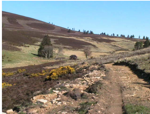
Fig. 2: Photo taken in a northern direction showing the lunch hut in relation to the existing path and surrounding area.